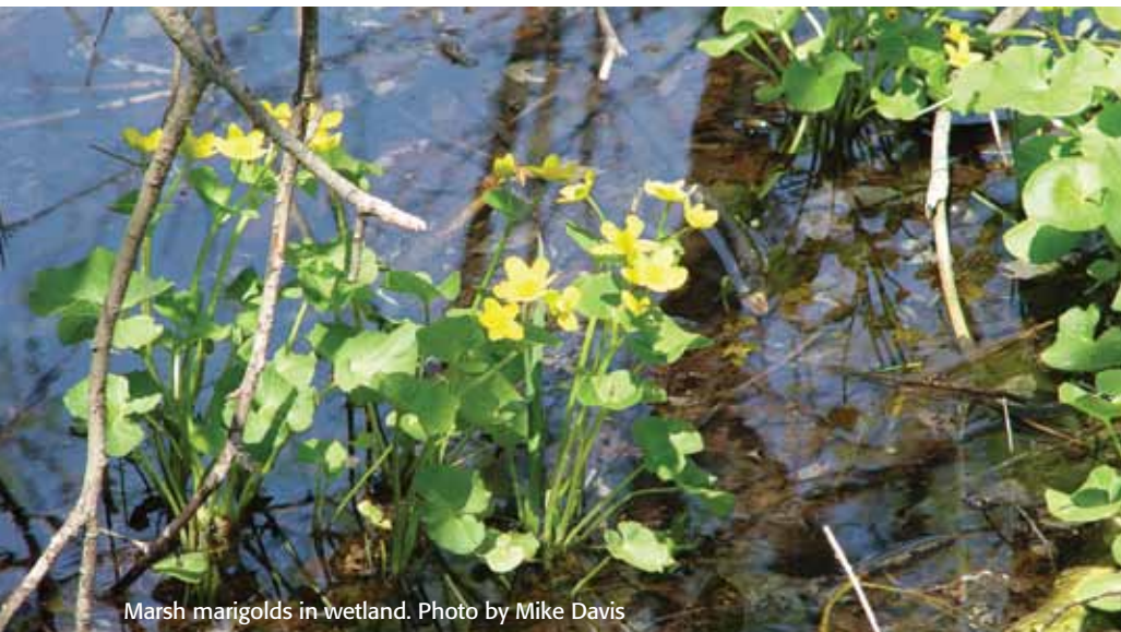
Marsh marigolds in wetland.

MORE INFORMATION: Environment Canada Ecological Gifts brochure