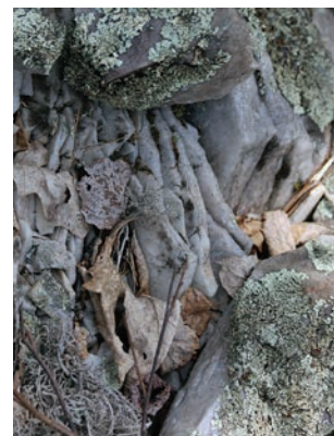
▲ Silica rocks possibly used by our ancestors for tool-making?

I hope we can protect the town site, right on the Manitou River where it joins Lake Huron. I hope that ghost of a town can be retained so we can all feel our place in the world