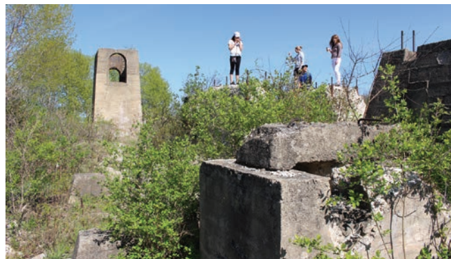
▲ At the mill ruins.

We are just a shadow, a flicker upon the earth. I'm reading about our ancestor apes which evolved 17 million years ago. I saw the silica hill in Sheguiandah where our First Nations ancestors may have chipped out stone tools 11,000 years ago. Or was it 20,000? We can't protect everything, but we should protect enough to remind us how small we are. And we must protect nature which has been evolving for billions of years. We are just one species and we have so much to learn by observation.